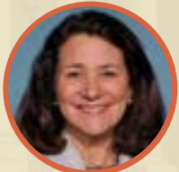
U.S. Representative Diana DeGette's Staff (D-CO)