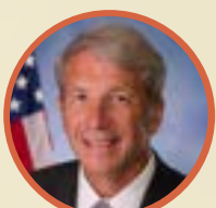
U.S. Representative Kurt Schrader (D-OR)