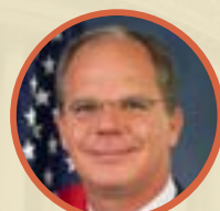
U.S. Representative Brett Guthrie (R-KY)