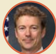
U.S. Senator Rand Paul (R-KY)