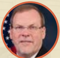
U.S. Representative Morgan Griffith (R-VA)