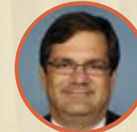
U.S. Representative Gus Bilirakis' Staff (R-FL)