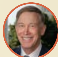
U.S. Senator John Hickenlooper (D-CO)