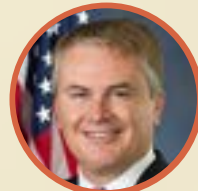
U.S. Representative James Comer (R-KY)