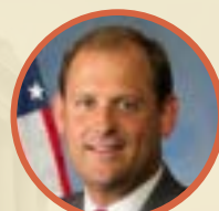
U.S. Representative Andy Barr (R-KY)