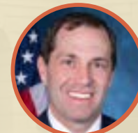
U.S. Representative Jason Crow's Staff (D-CO)