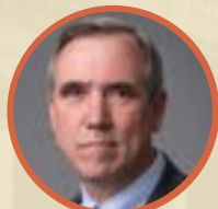
U.S. Senator Jeff Merkley's Staff (D-OR)