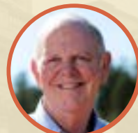
U.S. Representative Tom O'Halleran's Staff (D-AZ)