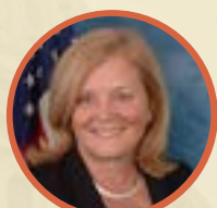
U.S. Representative Chellie Pingree (D-ME)